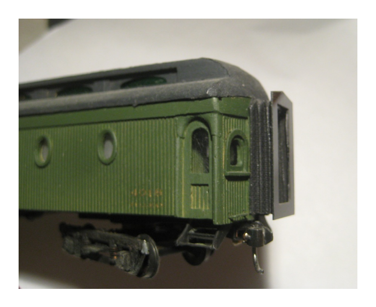
Door arch on all closed vestibule cars except HO-4

them close. Final fitting of the arch and quarter round over the door will be done when the headers are in place. Trim out all doors with headers and quarter round.