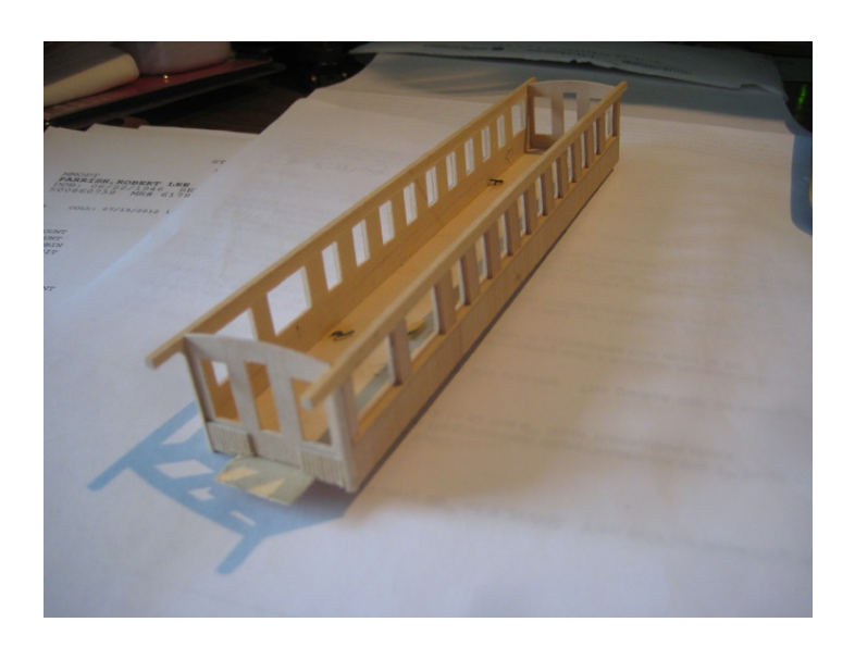
Core structure of passenger car. Kit HO-13 shown.

This now is the base structure of the model and all other parts will be assembled to it.