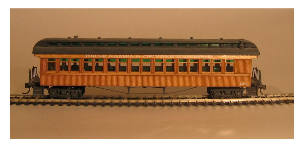
Completed open vestibule car, kit HO-11.

This article will assist you in building either an open or closed vestibule car. I will use an open vestibule car for construction and show photos of completed closed vestibule cars as appropriate. There are several articles on this web sited that are necessary for construction of these kits. The constructions show are in HO scale but O scale kits assemble in the same fashion.