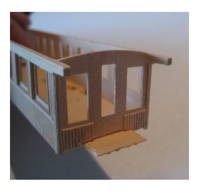
Bulkheads on open vestibule car.

Glue the bulkheads, one at a time, to the floor and block up with a square and allow to dry. When both bulkheads are secure the sides can be glued to the floor. The sides should fall in a location where the bulkheads glue to the inside of the side panels. There will be quarter round moldings that close the corner that will be applied later.